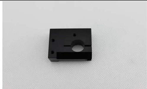
5. Product :