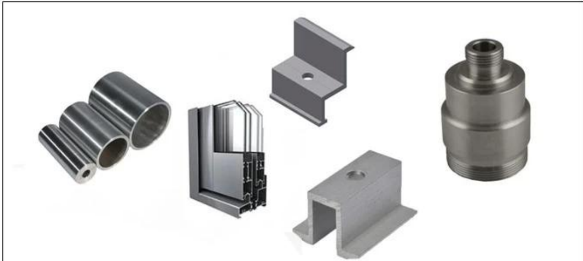
High precision processing technology