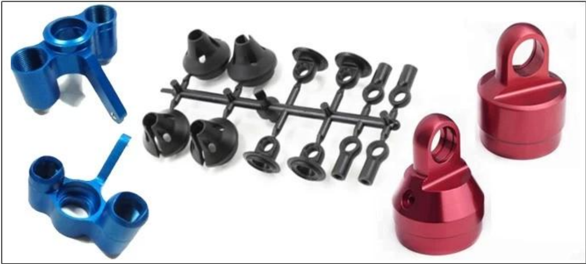
High quality surface treatment