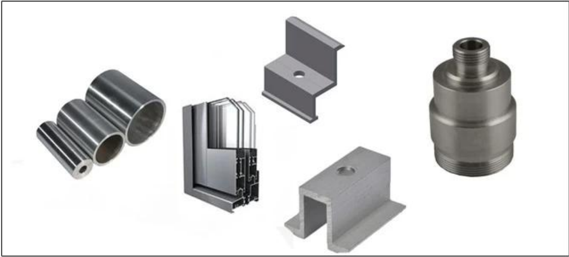
High precision processing technology